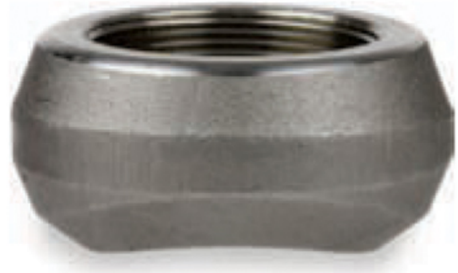
Fig. 43T03 – Threaded Outlet